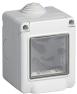
14902 - IP55 enclosure 2M